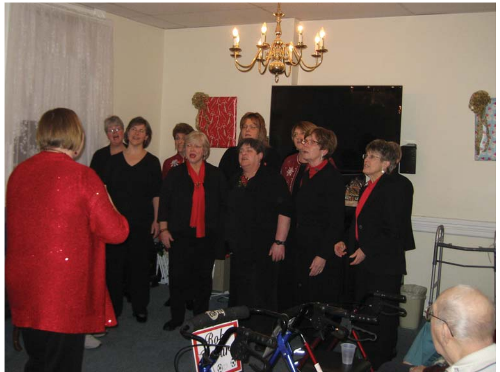
A Christmas performance by Champlain Valley at a local nursing home

holiday season. Starting on December 1 we sang at churches, schools, nursing homes, holiday parties and at our own Christmas Concert. That event was shared with the local men's barbershop chorus and included the first public performance by Notes of Accord, the newest registered quartet from our chorus. They were outstanding! We are looking forward to participating in the Global Open House sponsored by SAI with our own open house on January 9, 2013.