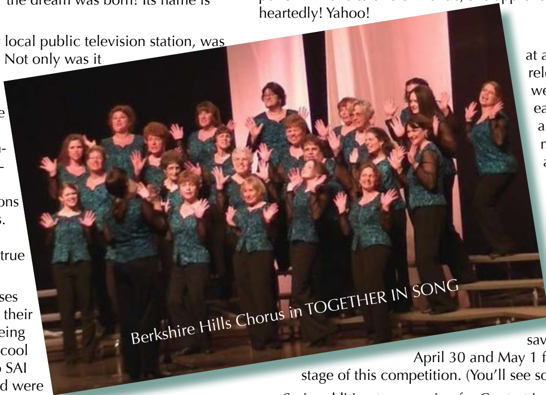
Berkshire Hills Chorus in TOGETHER IN SONG