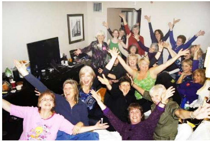
Royal River: There's always a party somewhere!