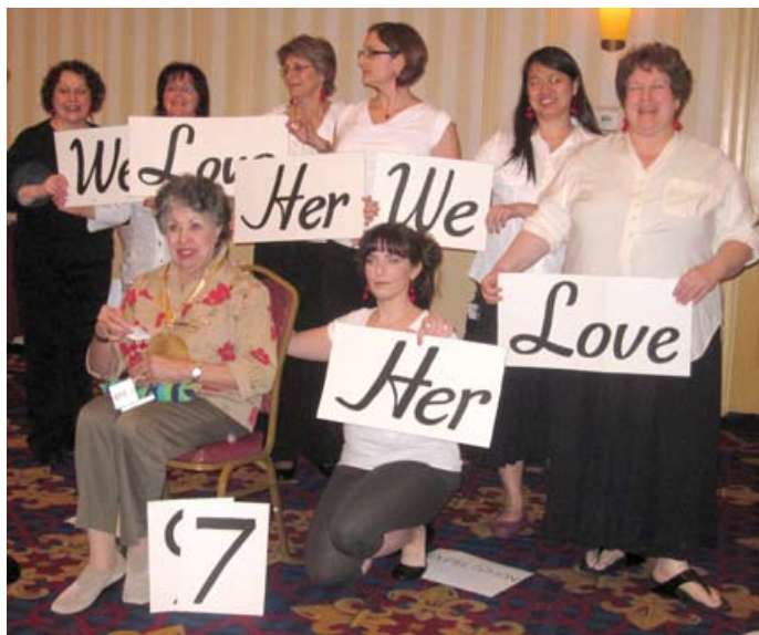
Liberty Belle on retreat!!