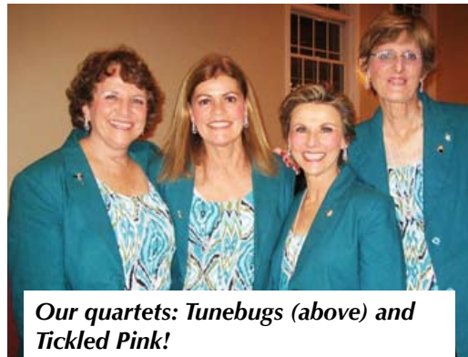
Our quartets: Tunebugs (above) and Ticked Pink!