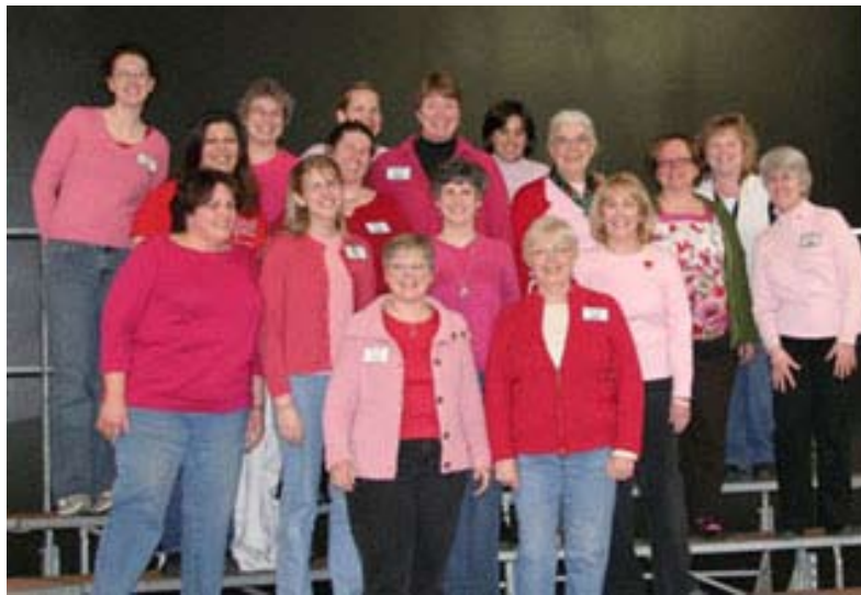
Profile Chorus: Pretty in Pink (left) and Goofy in Pink (below).

This past winter brought some challenges to our tiny chorus, much of it in the form of health-related issues. Many folks were sidelined from a few weeks to a few months, with ailments of varying degrees. But when we received the stunning news that not one but two of our