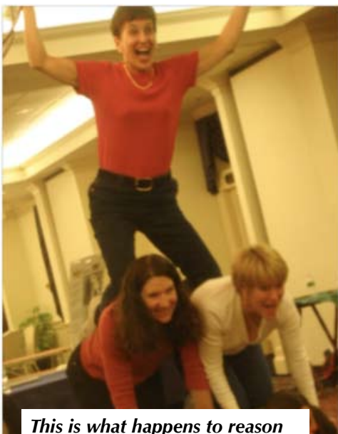
This is what happens to reason after too many adult beverages