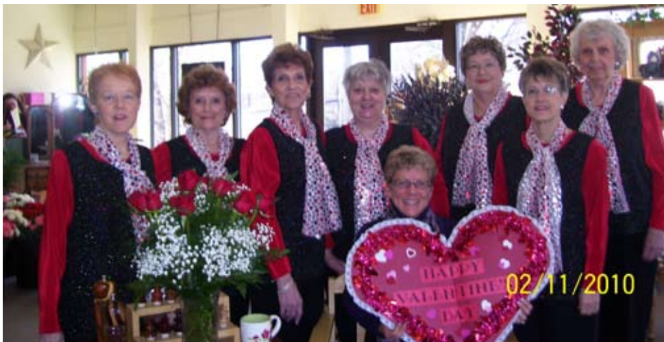
Champlain Valley Valentines!